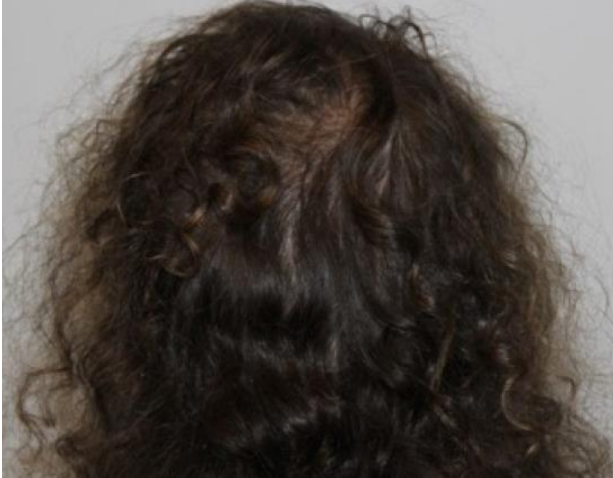
4 MONTHS POST TREATMENT

Unretouched photographs of subjects at baseline and 4 months following 3 consecutive monthly in-office HydraFacial Keravive treatments plus 90 day continuous use of HydraFacial Keravive Take-Home Spray